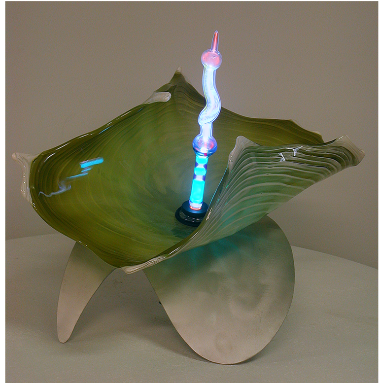
Swamp Lotus II